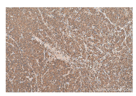
Immunohistochemical analysis of paraffinembedded human liver cancer tissue slide using KHC0790 (GSTO1 IHC Kit).