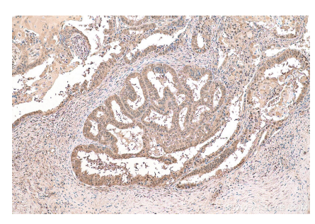
Immunohistochemical analysis of paraffinembedded human ovary tumor tissue slide using KHC0781 (GSS IHC Kit).