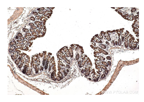
Immunohistochemical analysis of paraffinembedded mouse colon tissue slide using KHC0781 (GSS IHC Kit).