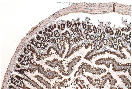
Immunohistochemical analysis of paraffinembedded rat colon tissue slide using KHC0781 (GSS IHC Kit).