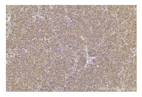
Immunohistochemical analysis of paraffinembedded human liver cancer tissue slide using KHC0781 (GSS IHC Kit).