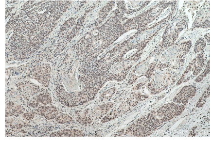
Immunohistochemical analysis of paraffinembedded human oesophagus cancer tissue slide using KHC0758 (POLE IHC Kit).