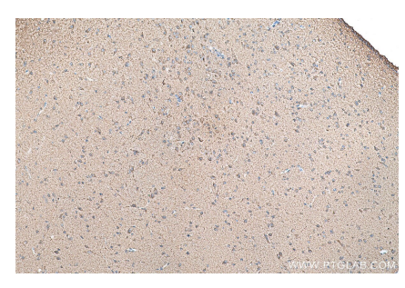
Immunohistochemical analysis of paraffinembedded rat brain tissue slide using KHC0757 (ARC IHC Kit).