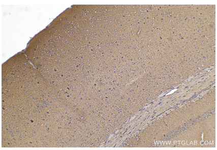
Immunohistochemical analysis of paraffinembedded mouse brain tissue slide using KHC0757 (ARC IHC Kit).