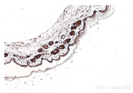
Immunohistochemical analysis of paraffinembedded mouse skin tissue slide using KHC0751 (KRT14 IHC Kit).

Immunohistochemical analysis of paraffinembedded human oesophagus cancer tissue slide using KHC0751 (KRT14 IHC Kit).