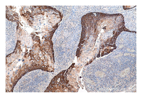
Immunohistochemical analysis of paraffinembedded human cervical cancer tissue slide using KHC0751 (KRT14 IHC Kit).