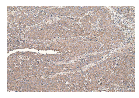
Immunohistochemical analysis of paraffinembedded human stomach cancer tissue slide using KHC0699 (CYB5R3 IHC Kit).