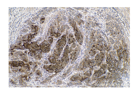
Immunohistochemical analysis of paraffinembedded human oesophagus cancer tissue slide using KHC0690 (ALDH3A1 IHC Kit).