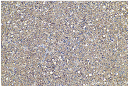
Immunohistochemical analysis of paraffinembedded human liver cancer tissue slide using KHC0690 (ALDH3A1 IHC Kit).