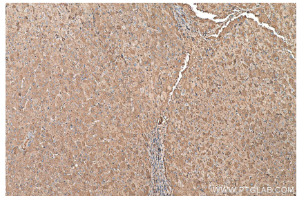
Immunohistochemical analysis of paraffinembedded human liver tissue slide using KHC0673 (HPX IHC Kit).