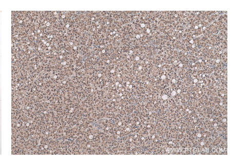
Immunohistochemical analysis of paraffinembedded human liver cancer tissue slide using KHC0639 (RPL23 IHC Kit).