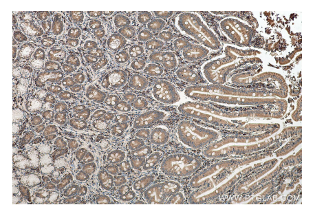
Immunohistochemical analysis of paraffinembedded human stomach cancer tissue slide using KHC0639 (RPL23 IHC Kit).