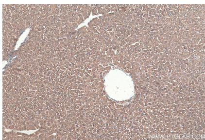
Immunohistochemical analysis of paraffin-embedded mouse liver tissue slide using KHC0391 (AADAC IHC Kit).