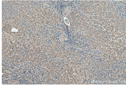
Immunohistochemical analysis of paraffin-embedded human liver cancer tissue slide using KHC0380 (AFP IHC Kit).