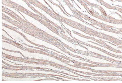
Immunohistochemical analysis of paraffinembedded rat heart tissue slide using KHC0360 (MY018A IHC Kit).