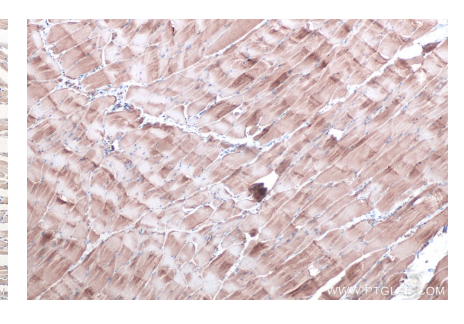
Immunohistochemical analysis of paraffinembedded rat skeletal muscle tissue slide using KHC0360 (MYO18A IHC Kit).