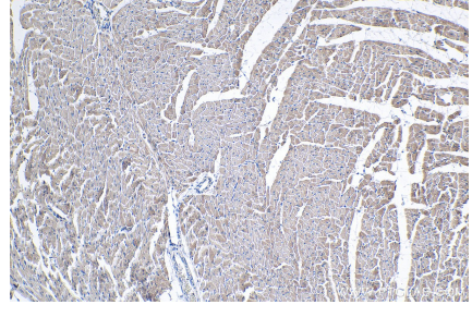
Immunohistochemical analysis of paraffinembedded rat heart tissue slide using KHC0341 (MYH6 IHC Kit).