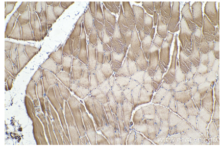
Immunohistochemical analysis of paraffinembedded rat skeletal muscle tissue slide using KHC0337 (MYH3 IHC Kit).