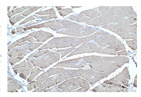
Immunohistochemical analysis of paraffinembedded rat skeletal muscle tissue slide using KHC0335 (MYL1 IHC Kit).