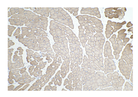
Immunohistochemical analysis of paraffinembedded mouse skeletal muscle tissue slide using KHC0335 (MYL1 IHC Kit).